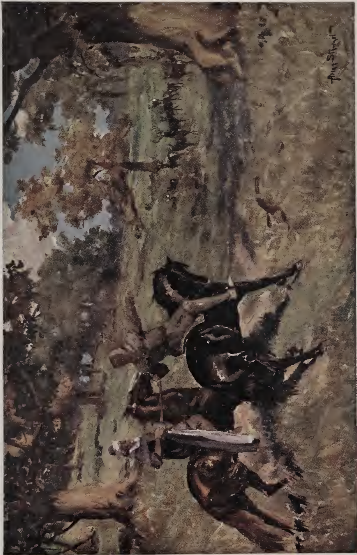
“THERE IS MY HERD OF CATTLE, GOOD MASTER SHERIFF!”